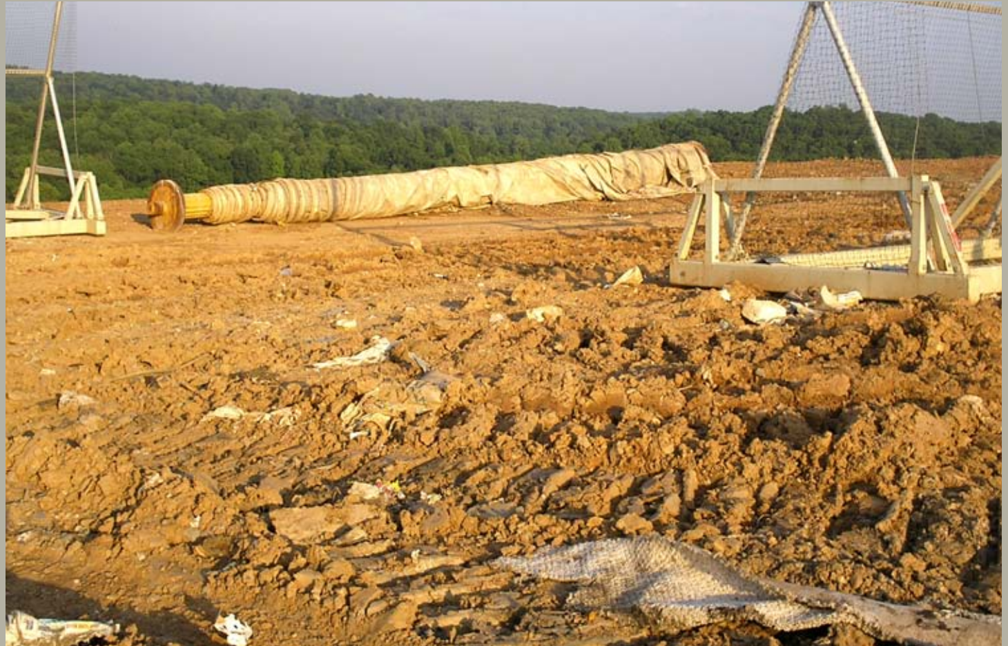
Unused rolled up tarp sits out amidst open trash.

These photos show closeup views of open trash, as seen in the distance photos. Trash and ash (black) dumped from county incinerator mixed together. Also shown is unused tarp, rolled up. Open trash is supposed to be covered with tarp at the end of every day if it cannot be covered with the required 6 inches of dirt. No attempt at temporary cover.