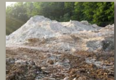
White powdered chemical waste