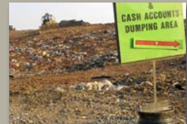
Homeowner's dropoff area