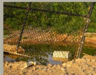
Open leachate, aka garbage juice