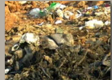
Trash and ash